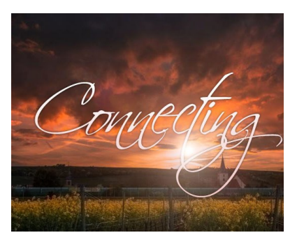
Reboot 3 "Why Small Groups Are God's Eternal Plan"